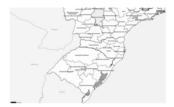
Fig. 2.1 Northern Paraná

The State of Paraná is divided into municipalities. For analytical purposes, the Brazilian Institute of Geography and Statistics (IBGE) has divided the state in ten regions, although there is no formal government authority established at such a level. In other words, these regions are supposed to be a basis for administrative decentralization, but are actually used merely for geographical and statistical reference. One of those "regions" is known as Central-Northern Paraná, which is the second most important region in Paraná composed of 71 municipalities including Londrina and Maringá, the two biggest cities after Curitiba, each hosts one of the two main state universities in Paraná.